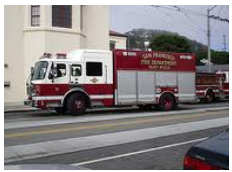
Heavy Rescue Squad