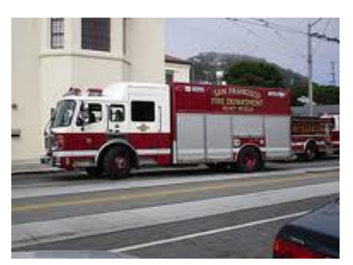
Heavy Rescue Squad