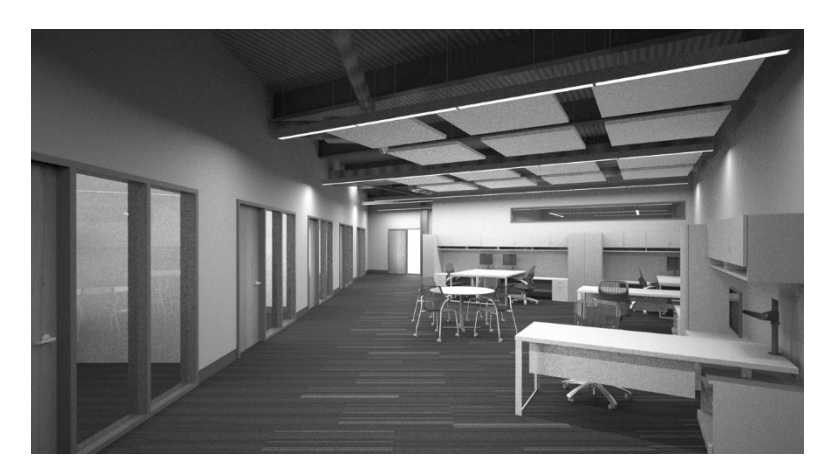
4th Floor Open Office