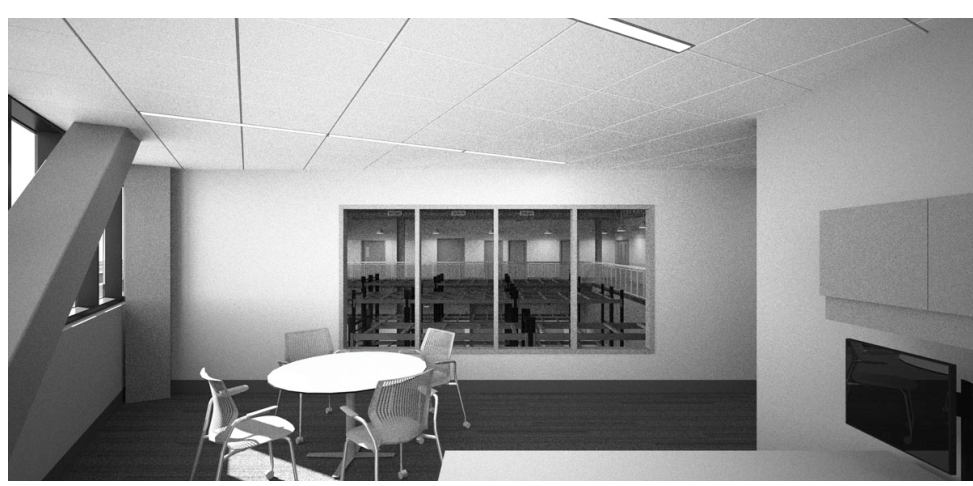
EMS 1 Office with view into Warehouse