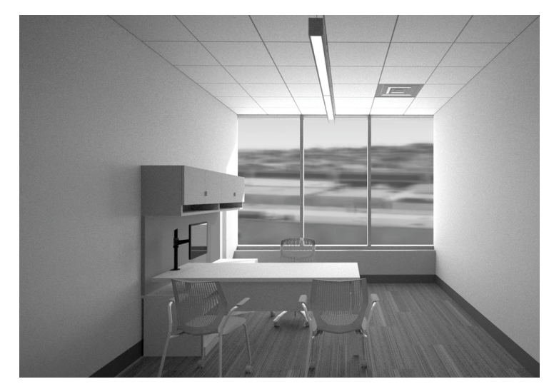
4th Floor Office