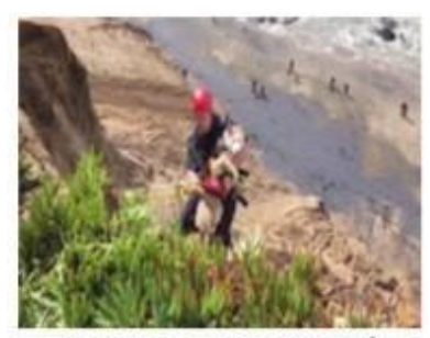
KEEP DOGS ON A LEASH!