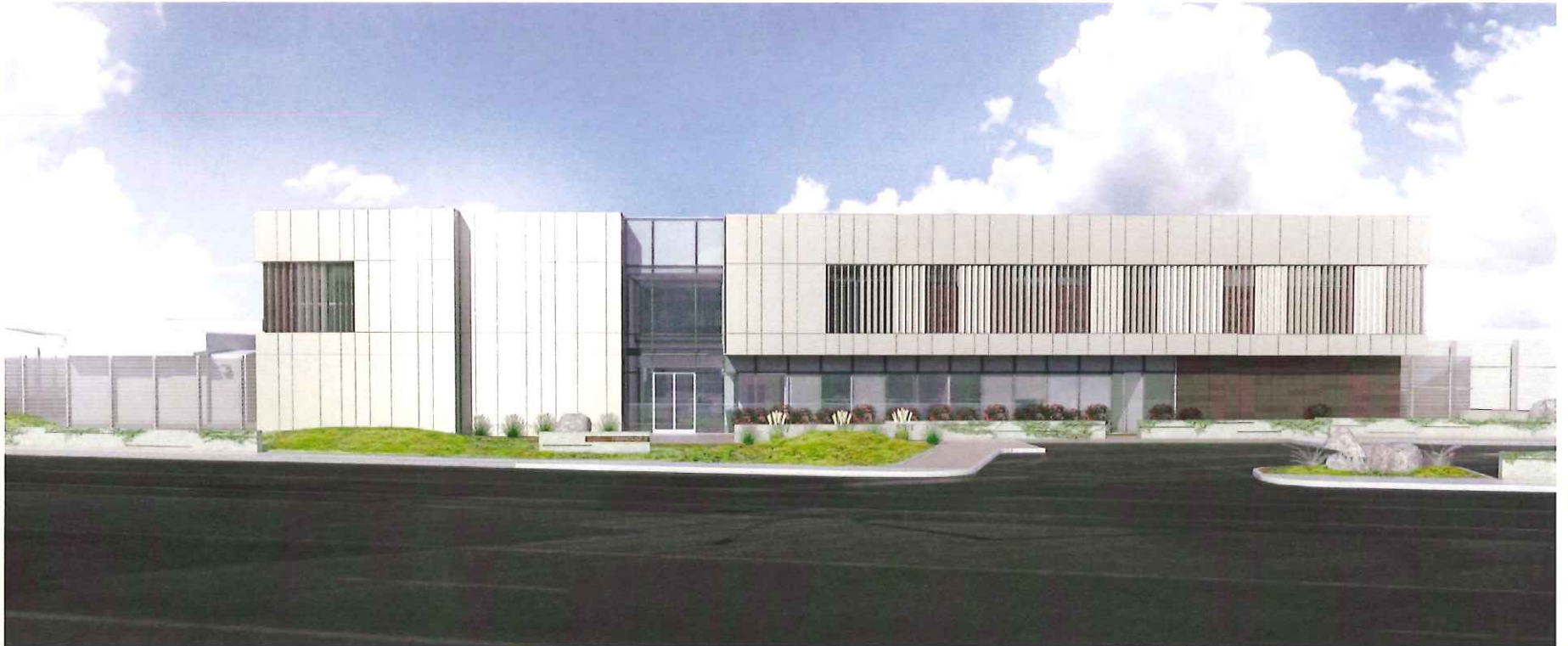
PROPOSED PHASE 2 ELEVATION - LOUVER (CHAMPAGNE PEARL), MULTI-ANGLE ORIENTATION (9°, 35° & 65°)