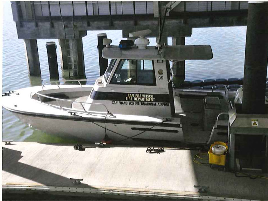
Boston Whaler Rescue 99