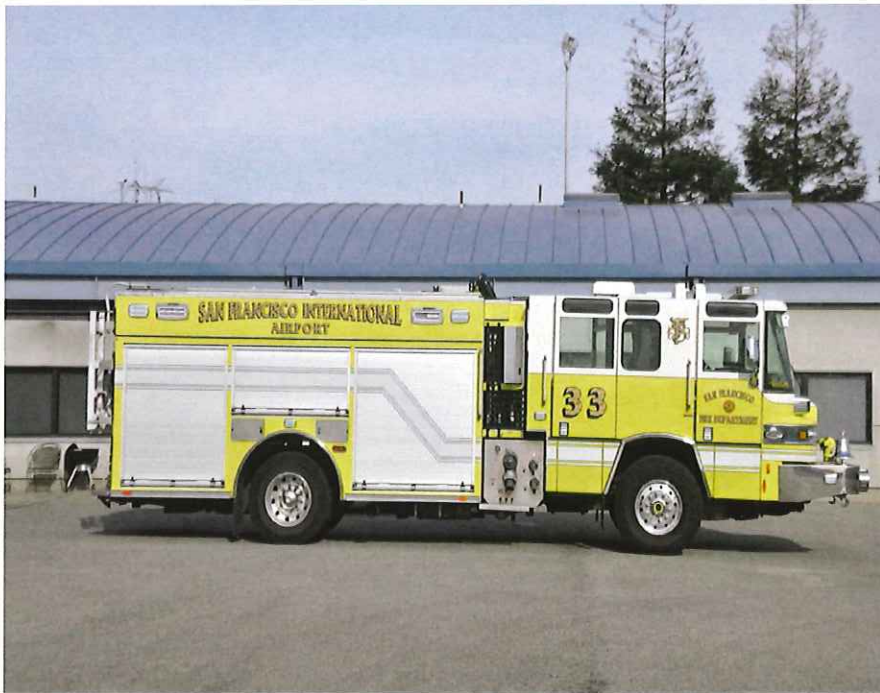
Rescue 33 1000 Gal Type 3 Engine