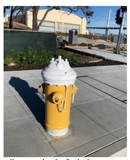
Captain James Kotter with yellow swatches for fire hydrants