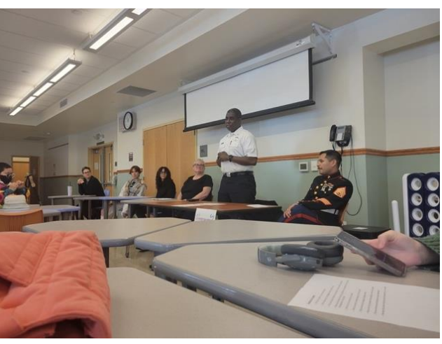
Independence High School Career Panel