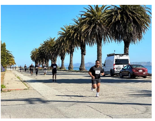
First Bootcamp held for those given provisional offers