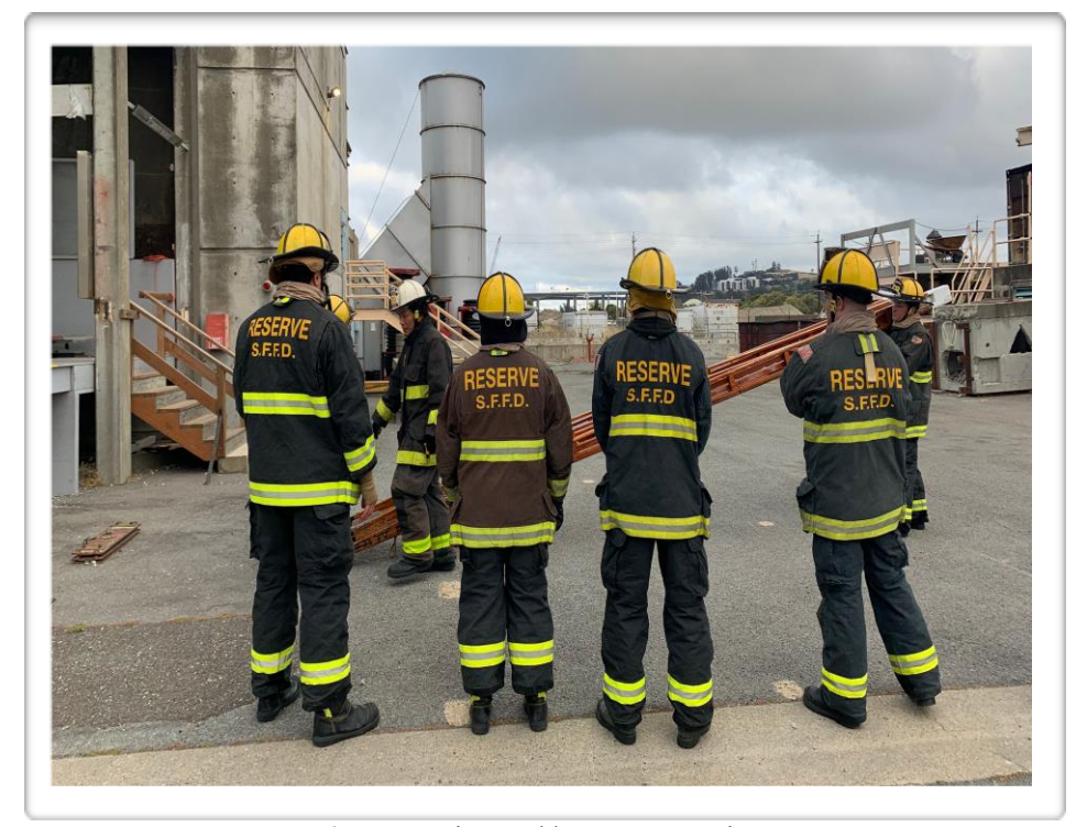
35' Extension Ladder Demonstration T.I., 6/22/2023