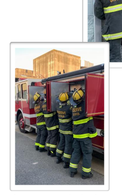
Fire Reserve recruits donning SCBA, T.I. 6/1/202