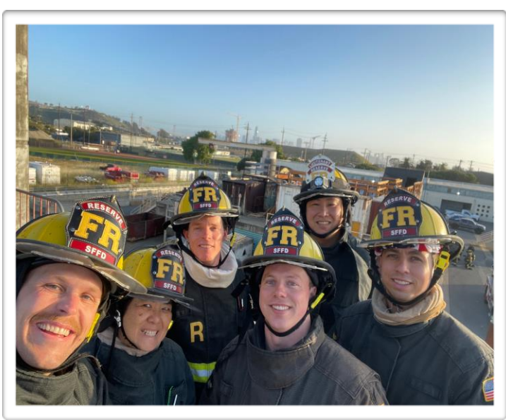
Fire Reserve recruits after climbing the 35' extension ladder, T.I. 6/1/2023