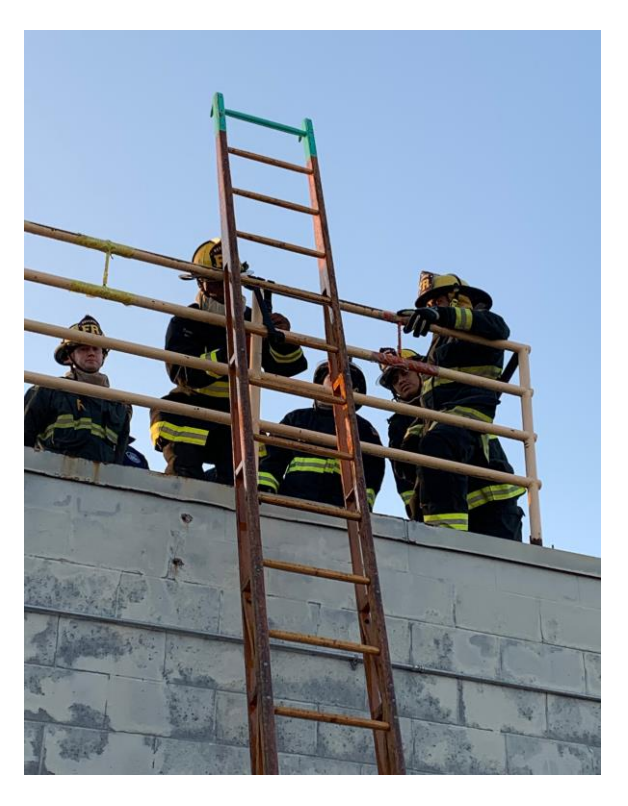
Fire Reserve recruits with 22' straight fire escape ladder, T.I., 6/15/2023