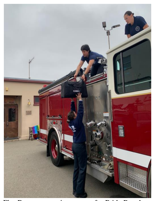
Fire Reserve recruits prepare for Pride Parade, DOT, 6/25/2023