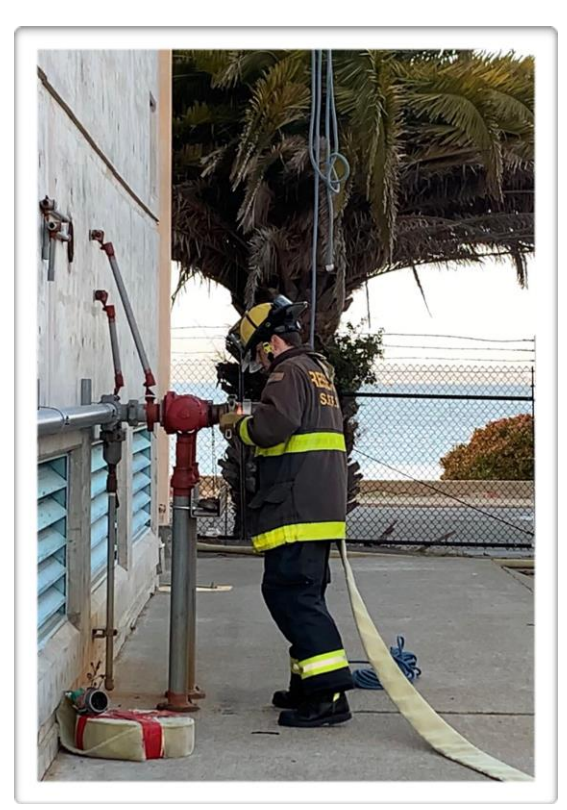
Fire Reserve recruit connects standpipe, T.I., 6/1/2023