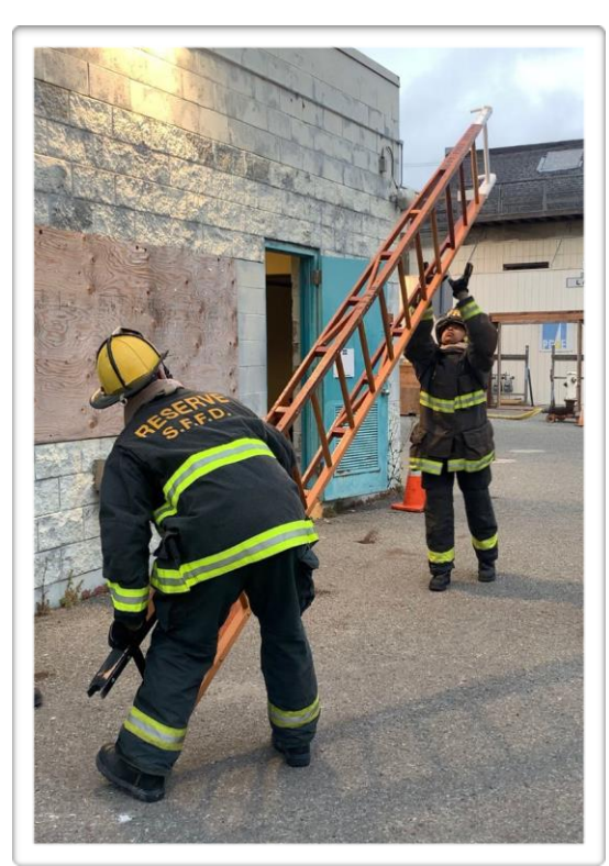
Fire Reserve recruits practice beam lowering 16'straight ladder, T.I., 6/22/2023