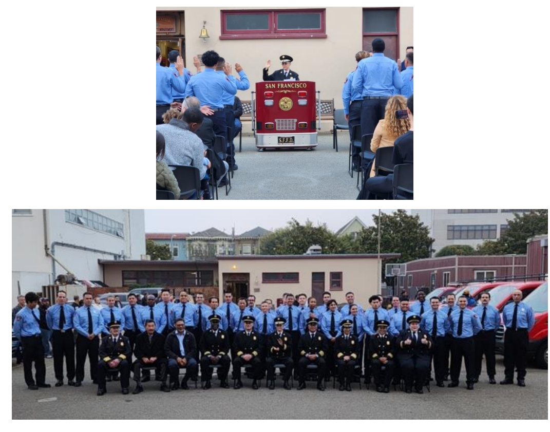
Fire Reserve Graduation