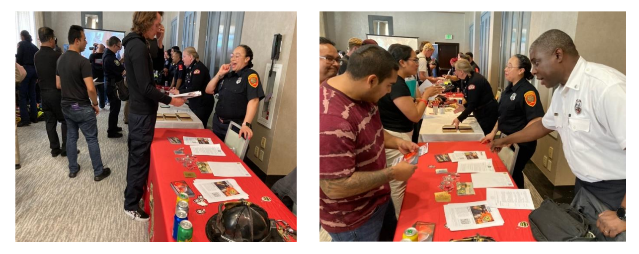
Bay Area Training Academy EMS Career Fair in Newark