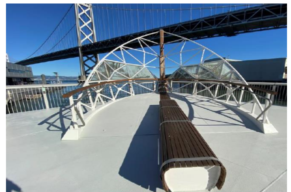
Observation Deck – Art Sculpture (Photo: 2/18/22)