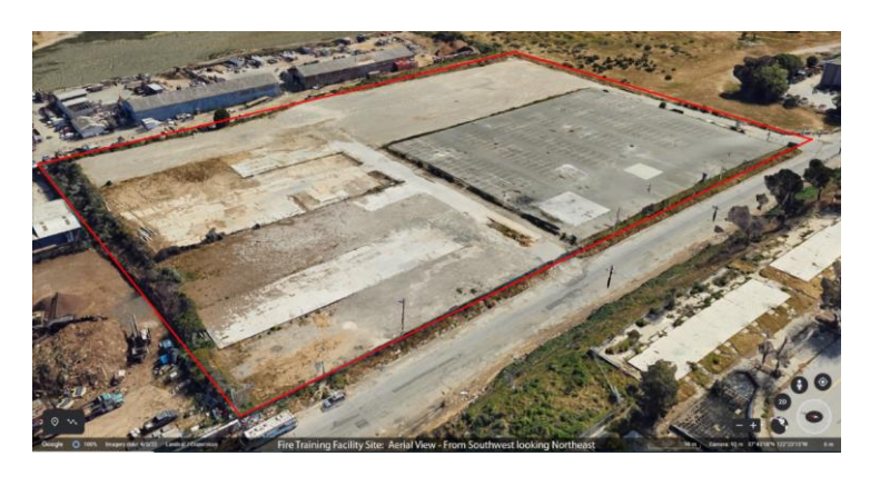
E.S.E.R. BOND 2020 NFS – Updates through September 2023 New Fire Training Facility (Scott Moran, San Francisco Public Works)

Budget : $275M Phase: Planning Schedule: