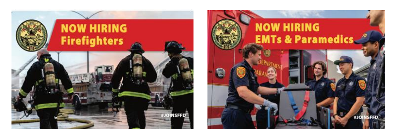
December 8 – Update SFFD H2 & H3 Recruitment Cards.