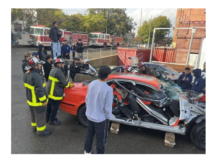
December 7 - Mission High Fire EMS Dual-Enrollment Program. Truck 11 to teach the students about Auto Extrication.