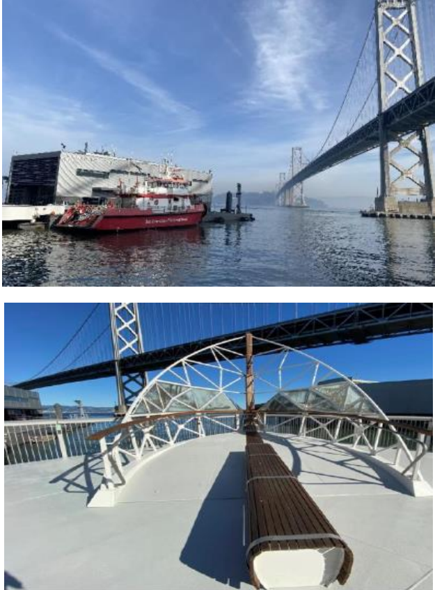
Observation Deck – Art Sculpture (Photo: 2/18/22)

[M. Rossetto] FS35 Security gate enhancement has emerged as a high priority for SFFD. Contractor procurement is underway with the construction NTP anticipated in January 2024. The contractor will be required to obtain permits from BCDC and the Port.