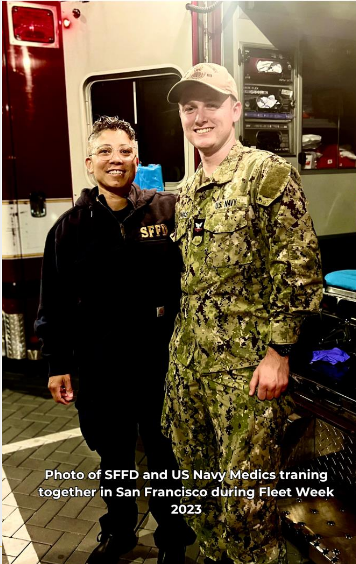
Photo of SFFD and US Navy Medics training together in San Francisco during Fleet Week 2023