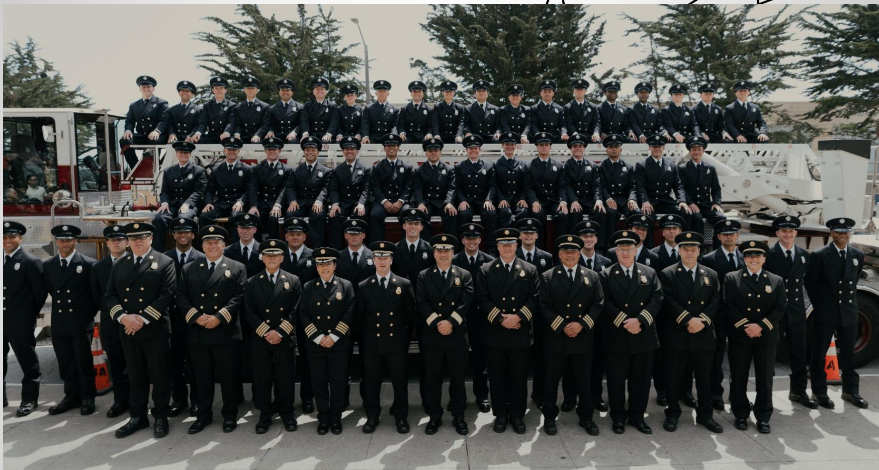
GRADUATION 135 TH FF RECRUIT ACADEMY