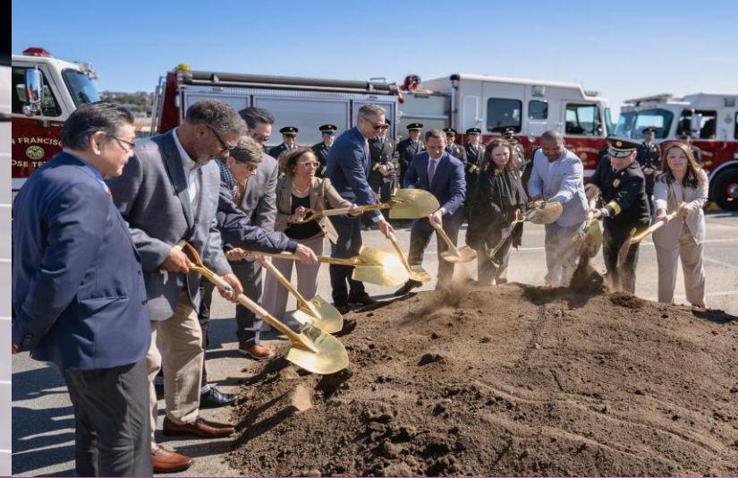
SFFD Training Facility Groundbreaking April 16