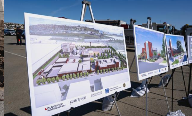
SFFD Training Facility Groundbreaking (cont.)