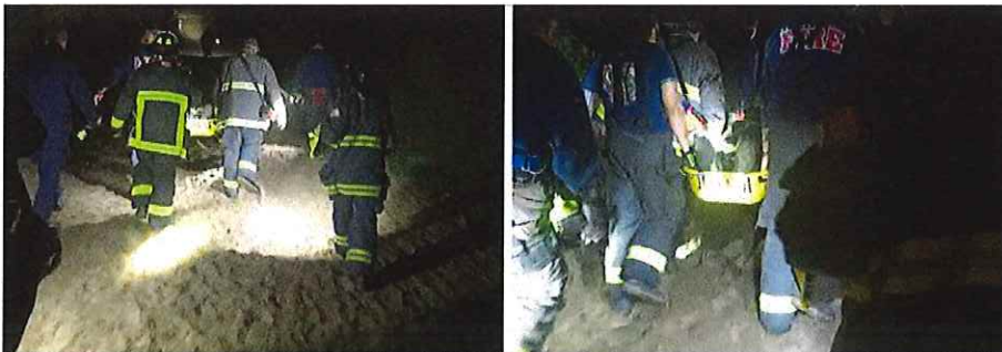
CLIFF RESCUE FORT FUNSTON - 12/10/2018