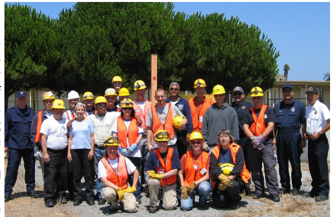
Instructors and Graduates!

Students in teams of 4 or 5 rotated through the four sessions gaining skills and developing as a team. Each instructor brought his own experience, helping students understand not just what to do by why and when. Everyone came away with a better understanding of basic support that NERTs - properly trained - can give firefighters in a disaster. NERTs can be extra hands and legs carrying tools or moving obstacles when firefighters are needed at the scene; we can be the clean-up crew, giving exhausted firefighters a well-deserved break. And it was fun! Racing through the tunnel with its unexpected changes, moving huge blocks of concrete and steel, exchanging stories and asking questions between rotations and at breaks, tying the instructor into the carrier, and just being out on the Bay on a glorious sunny morning. As a first class, it was First Class! ☺