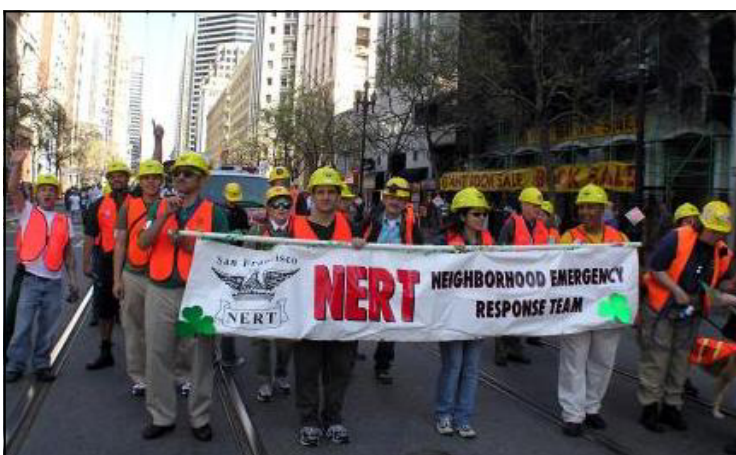
On Market Street—St. Patrick's Day Parade

The icing on the cake—we took fifth place in the Senior Marching Units (senior meaning not kids!) Who knew we could march?! 🍀