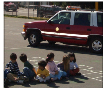
N stands for Neighborhood. Partner with your neighborhood schools to plan, prepare, and practice!

Congrats to Commodore Sloat School! Gold stars for everyone!