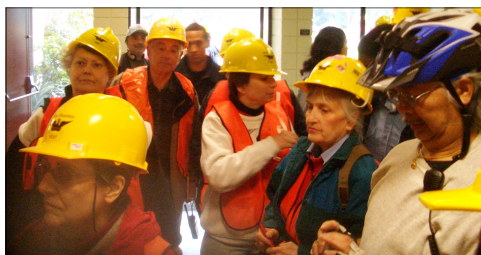
Ready for Anything!

age! We will need to monitor and comfort the injured; create cohesive plans from incomplete information; gather and track the supplies we'll need in a staging area—and so much more that can be done by trained NERTs regardless of age!