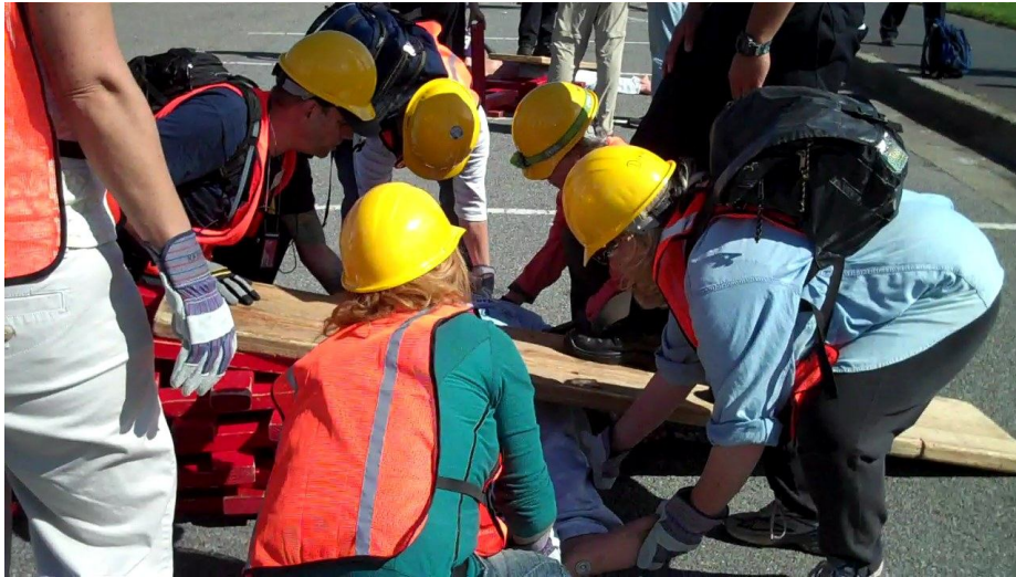
NERT members practice using cribbing to lift heavy objects.