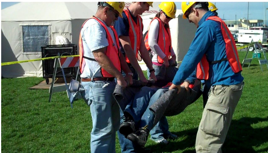
NERTs practice carrying a "victim" using the "blanket carry."