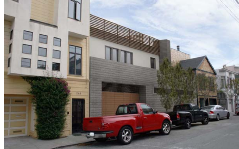
FS16 Rendering – view from Pixley St.