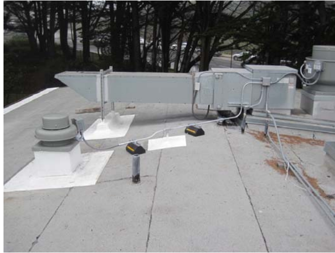
FS10 roof flashing @ mechanical unit