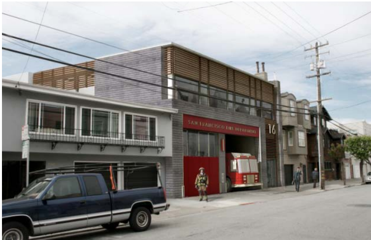
FS16 Rendering – view from Greenwich St.