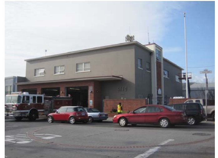
FS17 exterior envelope