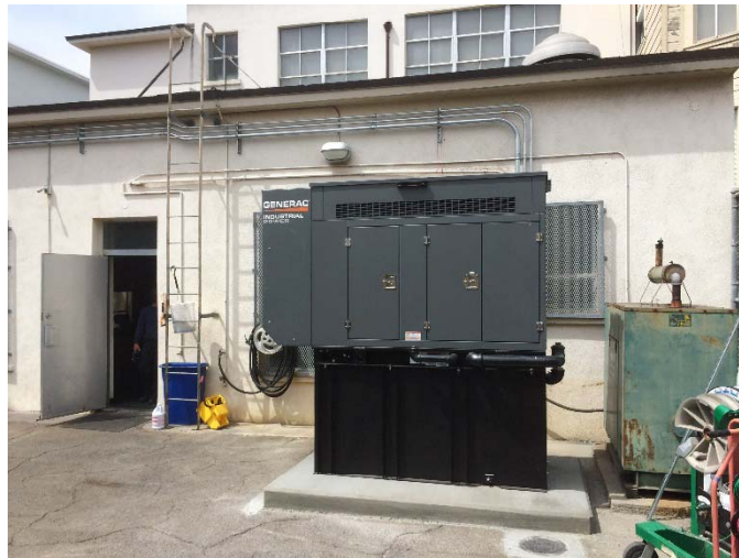
FS21 emergency generator