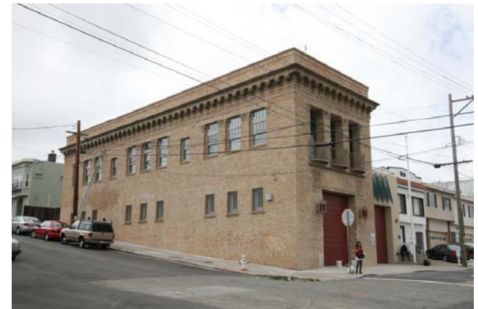
FS44 view from Wilde Ave @ Girard St.